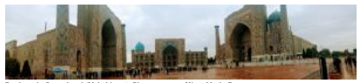
Registan in Samarkand (Uzbekistan)

According to UNESCO, the first caravans aiming to connect East (China) with West (Central Asia) were dispatched in 138 AD, leading eventually to the formulation of what we know today as the Great Silk Road. The Uzbek corridor, consisting of Bukhara, Tashkent, and Samarkand, provided key routes for trade and also served as a burgeoning center for thought leadership, cross-cultural exchange, and relations.