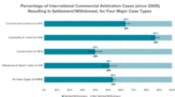
Figure 1: Percentages of international commercial arbitration cases (since 2005) resulting in settlement/withdrawal for each of four major case types (with a similar result for all case types shown for comparison). Margin of error (indicated by error bars) is computed at the 95% confidence level. To simplify the MOE computation, other case outcomes are grouped into a single “not settled/withdrawn” category.

For example, let us consider how the proportion of cases resulting in settlement/withdrawal varies by case type. In the DRD repository, the four largest sectors (by number of cases entered in the database) presently include commercial contracts (817 cases), hospitality & travel (456), construction (369), and wholesale & retail trade (314). From Figure 1, we can see that in all but one of these case types, settlement/withdrawal is the most frequent outcome, but in addition, the MOE varies inversely with the number of cases.