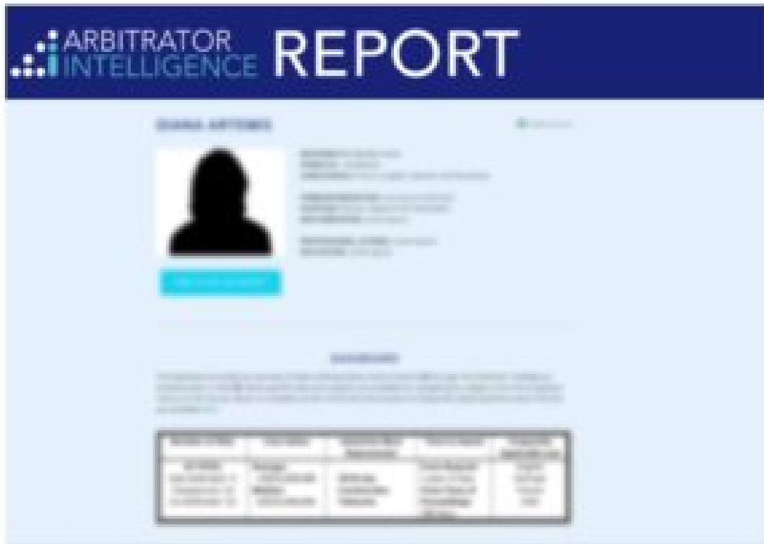
Image of dashboard for Prototype.

After the formal launch of the Prototype, we will be organizing numerous other presentations both in physical venues around the world and through online webinars. The purpose of these events will be to obtain feedback on the Prototype to revise and refine our work as we begin production of AI Reports on actual arbitrators. If you are interested in organizing such a presentation, please contact info@arbitratorintelligence.org .